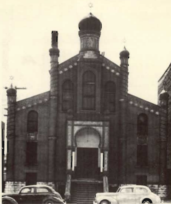
1888 — FIRST STRUCTURE BUILT ON COLLEGE AVENUE