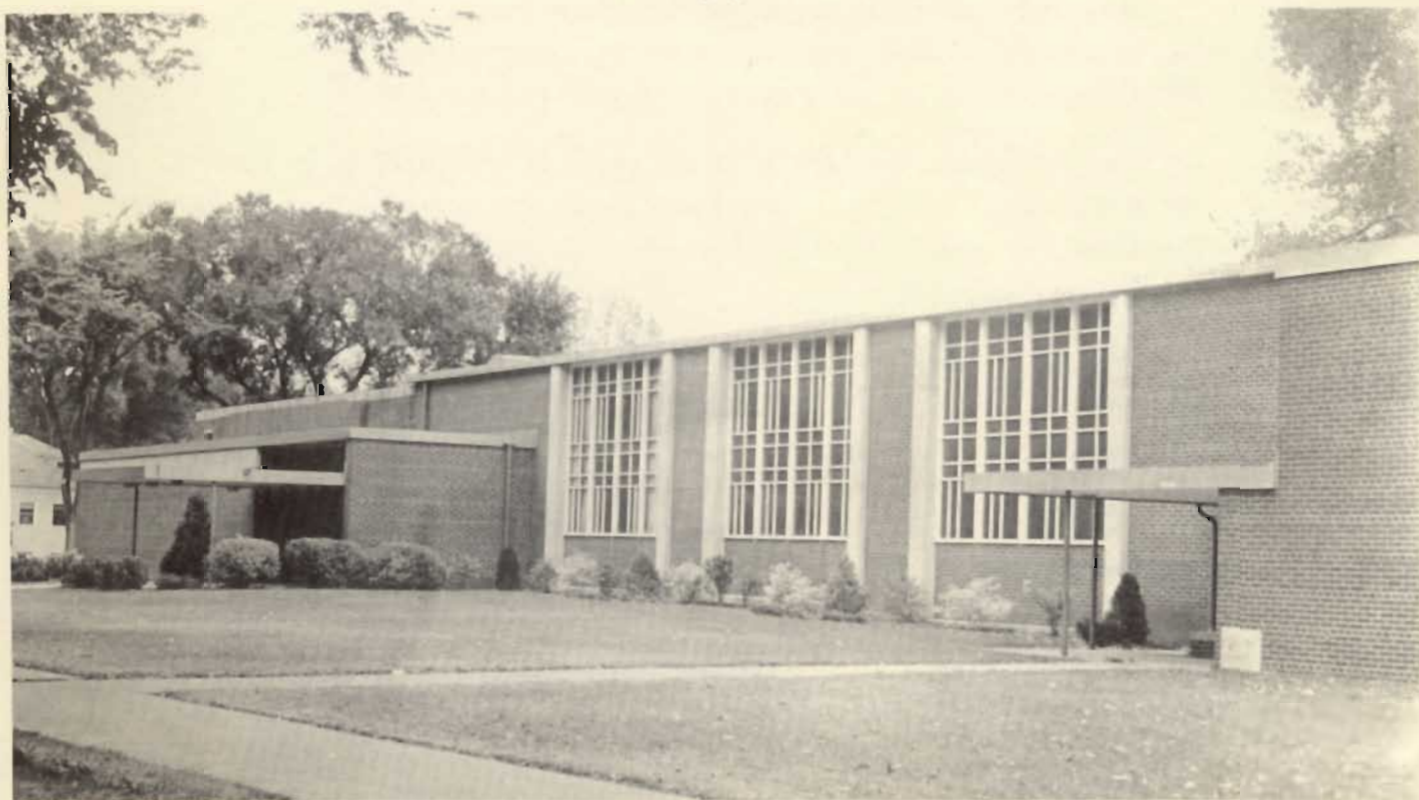
1950 — PRESENT STRUCTURE BUILT ON AVENUE PORTLAND